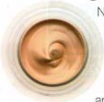
Elizabeth Arden Ceramide Ultra Lift and Firm Makeup SPF 15, $42.